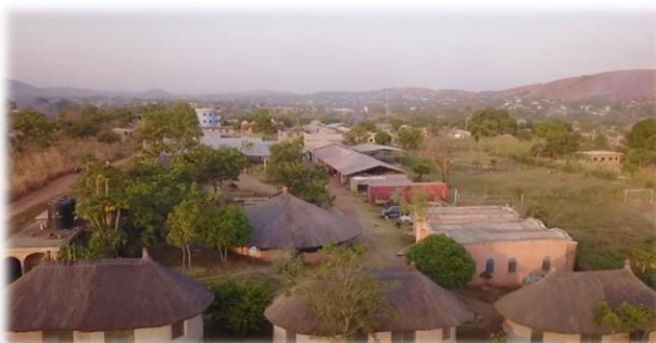
2019 – New partner CFL Liweitari