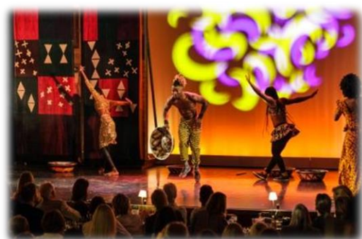
2019 – Charity for the project