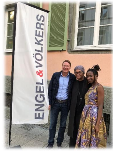
2019 – Engel und Völkers – one sponsor of the project